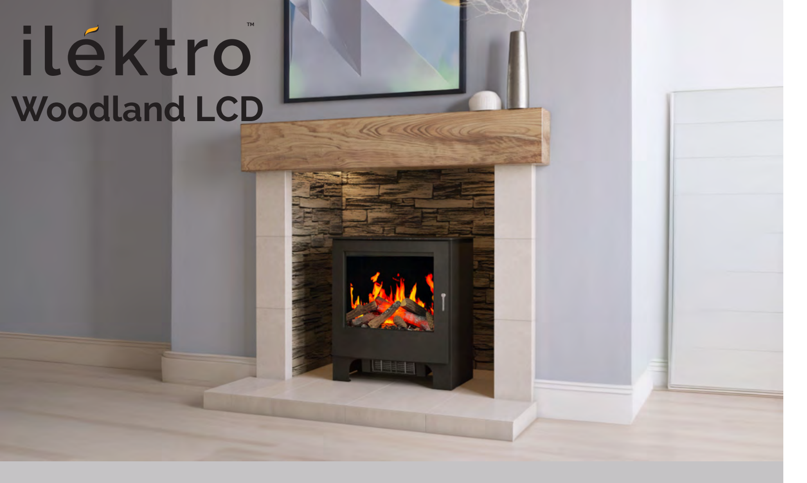
Woodland LCD - The Charm of a Woodburning Stove, Reinvented by Paul Agnew Designs

The Woodland LCD Electric by Paul Agnew Designs redefines what an electric stove can be - a perfect fusion of craftsmanship, cutting-edge technology, and timeless style. Inspired by our award-winning Woodland woodburning stove, this electric model retains the traditional allure of a classic log burner while embracing the ease and efficiency of modern living.